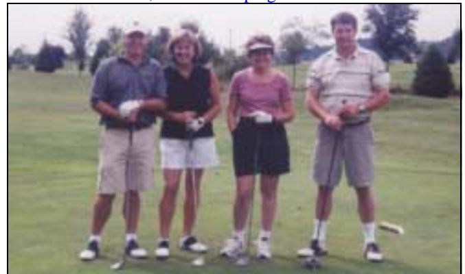
Eager Golfers ready to tee-off!